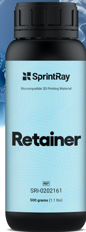
SprintRay Retainer 500g SRI-0202161

This resin is Class I MDR certified and part of a fully validated biocompatible direct print retainer system, which includes free AI Retainer Design. With this breakthrough, dental professionals can look forward to producing high-quality retainers with precision and ease.